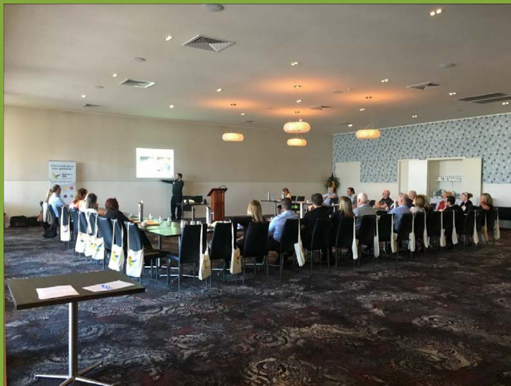
Waurin Ponds Hotel 2018